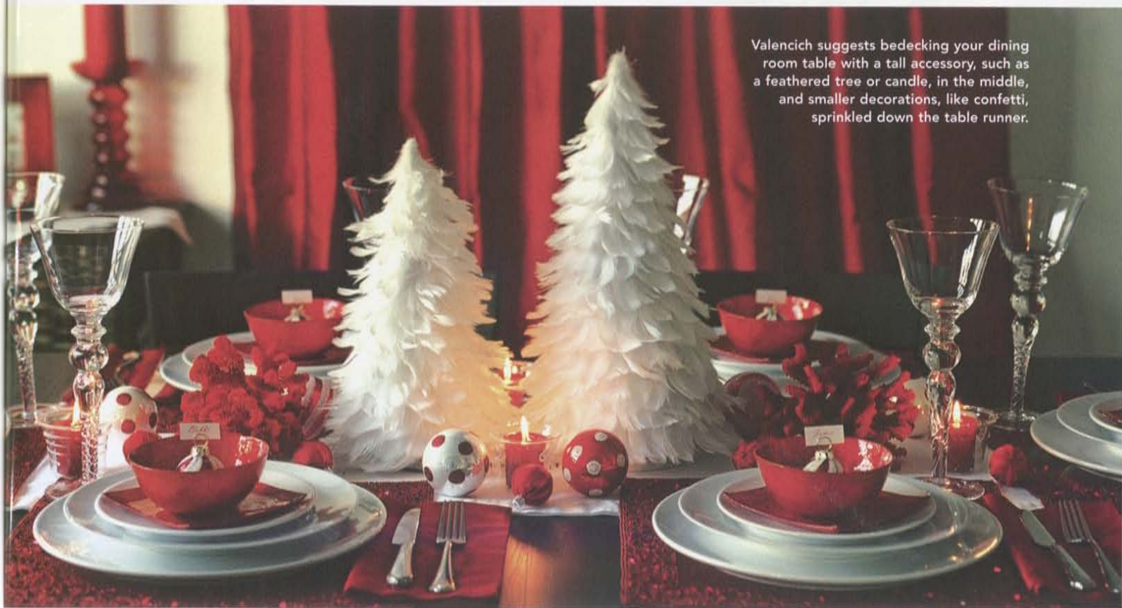
Valencich suggests bedecking your dining room table with a tall accessory, such as a feathered tree or candle, in the middle, and smaller decorations, like confetti, sprinkled down the table runner.